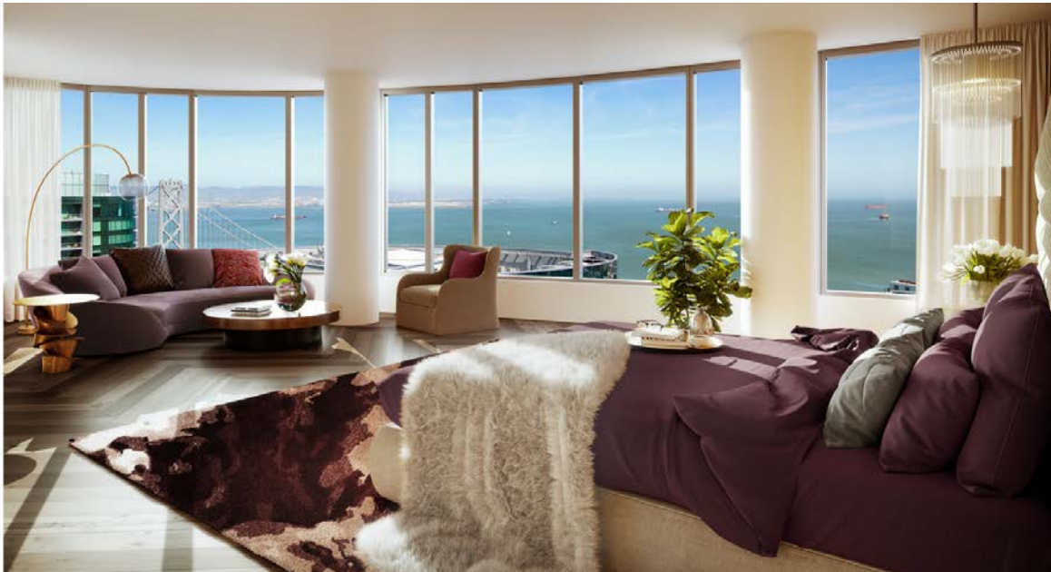
Kendall Wilkinson Design/Steelblue