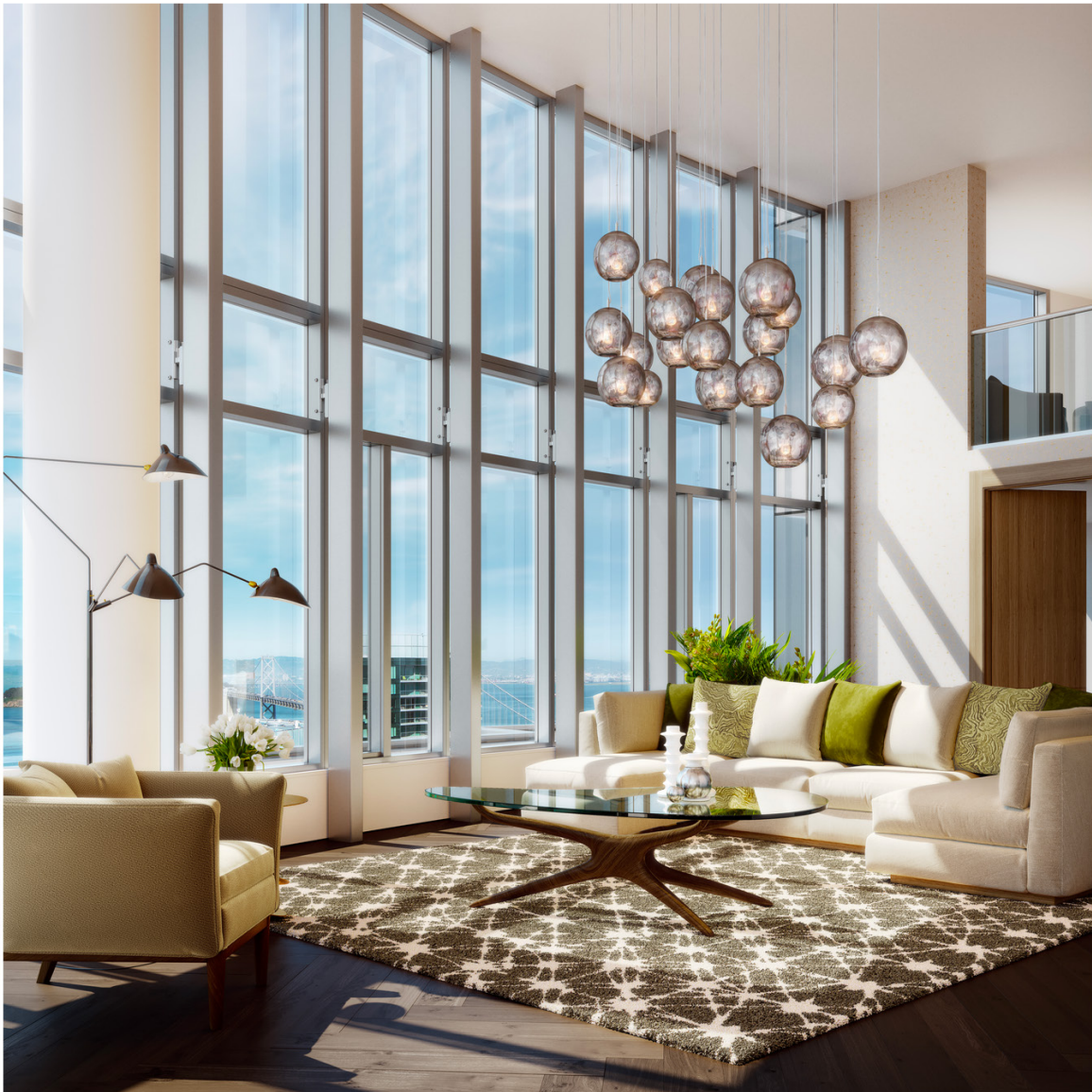
Kendall Wilkinson Design/Steelblue

The units take up the top two floors of the taller, 42-story tower B. The price of the smaller, 5,200-square-foot penthouse starts at $13.5 million for the shell, with the sky as the limit depending on customization. The larger penthouse, the price of which has yet to be disclosed, has 5,700 square feet and is wrapped in a glass facade that gives the home 360-degree views of the city and bay, according to the developer.